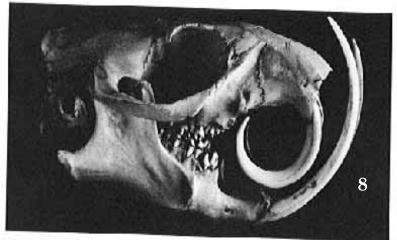
Skull with abnormal incisors