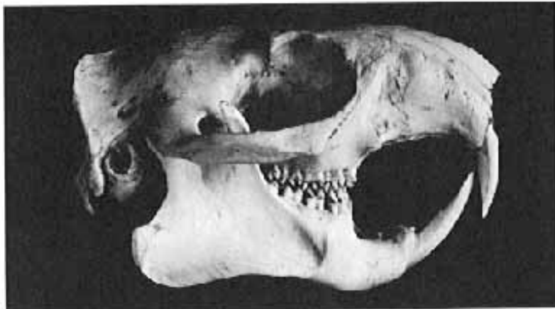
A normal woodchuck skull